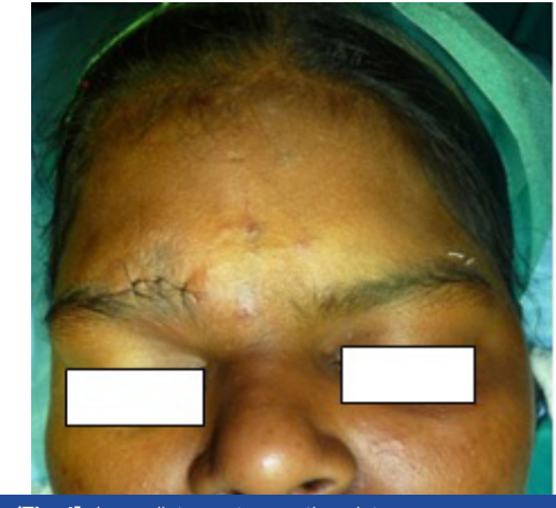
[Table/Fig-4]: Immediate post-operative picture

The pathogenesis of ALHE is unclear and there is confusion whether it is a benign vascular lesion or a reaction to trauma [7] that usually occurs in the skin and subcutaneous tissue. It generally presents in adults and it is an indolent lesion, with an average time between appearance and excision of four to five months [8]. Other areas where they are found are bone, liver, pleura, heart and soft tissues of thigh and pelvic cavity.