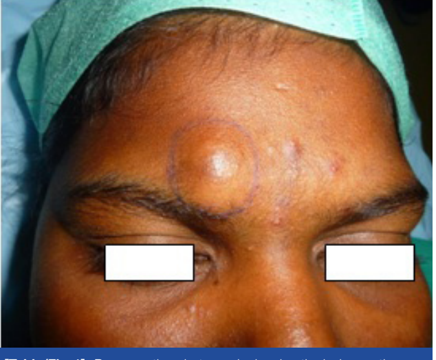
[Table/Fig-1]: Pre-operative photograph showing the lesion on the forehead

Epitheloid haemangioma was first described in 1969 [1]. It is also known as Angiolymphoid Hyperplasia with Eosinophilia (ALHE) or benign angiomatous subcutaneous proliferation. The lesions are usually nodular or papular in the subcutaneous regions of the head and neck of young females [2] generally in the third to fifth decade. It can occur in all races. It usually presents with pruritis and regional lymphadenopathy. There may be eosinophilia in the peripheral smear. It has been